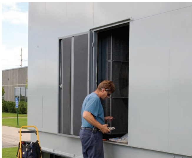
Figure 3. Regular exercise and maintenance of the complete power system are very important factors in high reliability.

Proper training of operating personnel is essential for a reliable standby power system since human error or neglect is responsible for the majority of power system failures. Personnel training begins during the commissioning process and should cover system operation, record-keeping and periodic maintenance. Operators must be familiar with all the power system components, alarm conditions, operation and maintenance procedures. Special attention should be given to critical subsystems such as fuel storage and delivery, starting batteries, engine coolant heaters, and air flow in and out of the generator building or enclosure. Frequent retraining is also necessary, along with making sure that personnel maintain an operational history of the power system. Consult your generator set manufacturer about factory training opportunities available to customers.